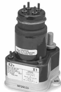
Cat. No. 6042H46 SPST, 50 Amp w/Auxiliary