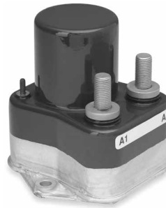
Cat. No. 6042H153 SPST, 300 Amp