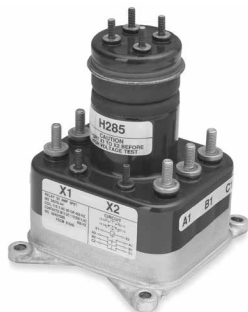
Cat. No. 6042H285 3PST, 50 Amp w/Auxiliary