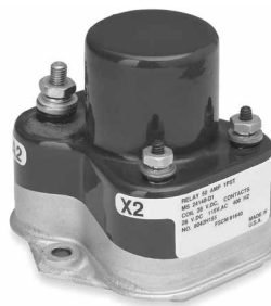
Cat. No. 6042H155 SPST, 50 Amp