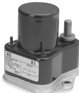
Cat. No. 6042H151 SPST, 200 Amp