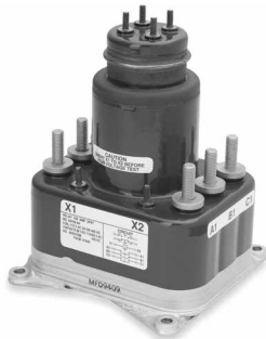
Cat. No. 6042H286 3 PST, 100 Amp